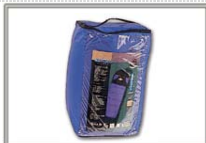
Complete with display carry bag